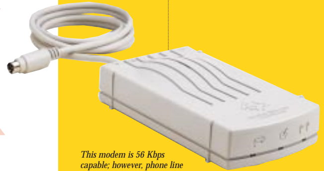
This modem is 56 Kbps capable; however, phone line conditions or regulations may limit download speeds to 53 Kbps or less.

With speeds of up to 56 Kbps, the TelePort 56K cuts Web page and remote access downloading time almost in half!