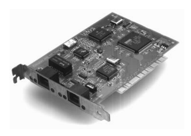
The "Fast" Ethernet BOCALANcard-PCI comes with driver diskette and installation manual.